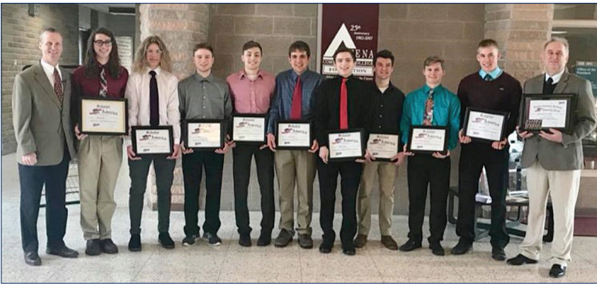
The 2017 ACC Cross Country Team.