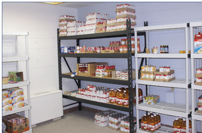
The ACC Food Pantry.