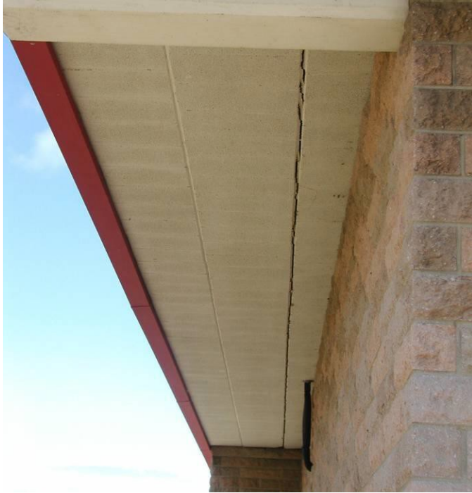
Concrete plank roof shifting at Besser Technology Center – connecting cables are suspect.