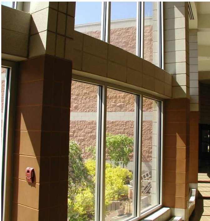
Concrete block between upper and lower windows allowing water infiltration – flashing is suspect.