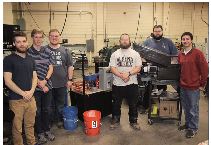
Students from four ACC programs joined forces to build a plastic shredder and extruder.

Students from David Cummin's Team Design Project class took the plastic shredder project one step further by designing and building an extruder which takes the shredded plastic, melts it and extrudes it into one continuous profile. This fall, students will use design elements from the extruder to build a beam extruder for making the plastic blocks needed for CNC machining. They also plan to redesign their shredder to become more efficient and allow for increased production volume.