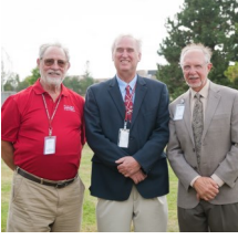
ACC Holds 70th Anniversary Open House