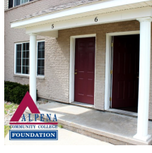
ACC Foundation Offers A Place to Live & Learn