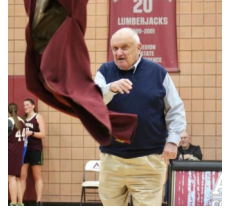
ACC Alumni Basketball Game Planned